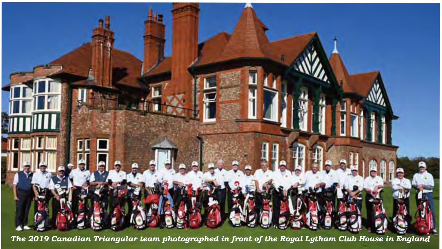
The 2019 Canadian Triangular team photographed in front of the Royal Lytham Club House in England